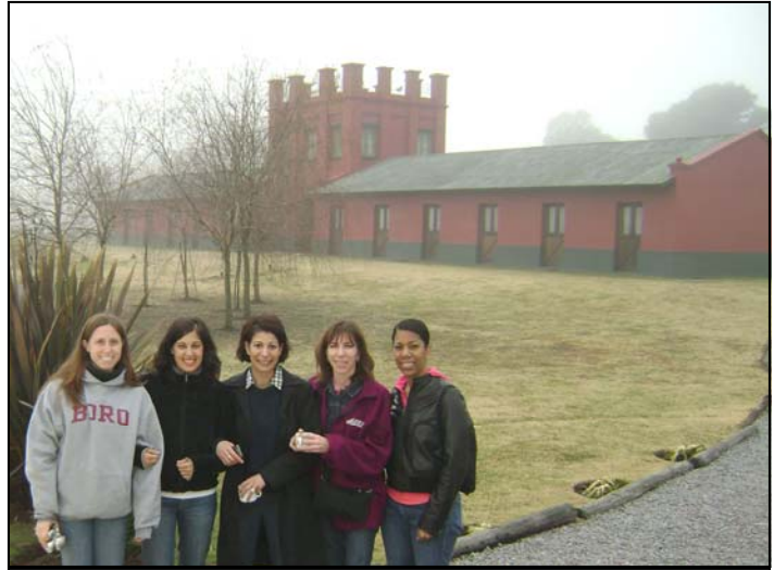
Students from the O4 cohort visited an Argentinean Ranch (estancia) to enjoy horseback riding.

describes her unique realization of the "similarities between my home country (Turkey) and Brazil/Argentina—mostly in terms of daily interactions, business life and even the effects of government on how to conduct business."