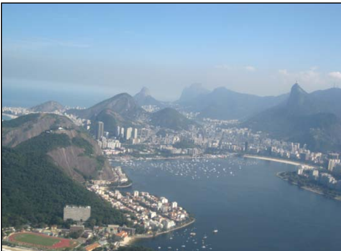
Rio de Janeiro, Brazil

The next EMBA and GMBA cohorts will definitely have a unique journey to look forward to next summer!